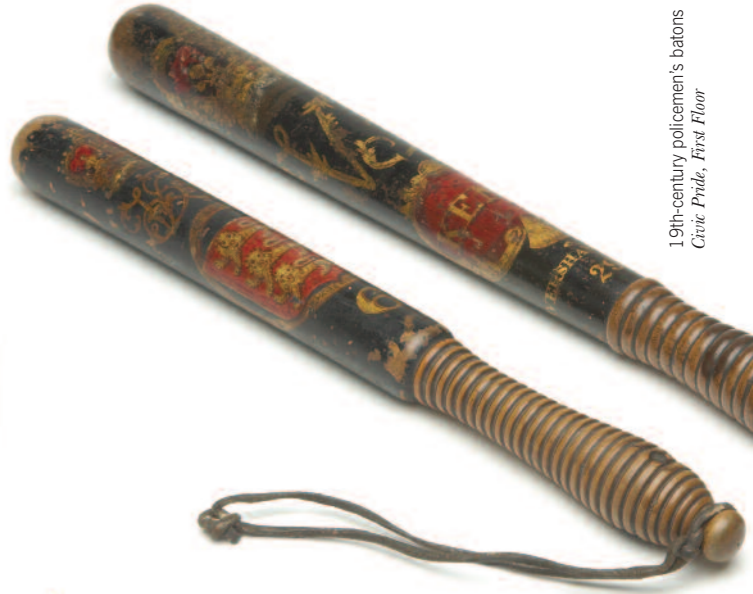
19th-century policemen's batons Civic Pride, First Floor