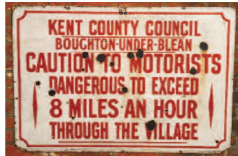
Boughton-under-Blean 1920s speed sign Hand water pump Both Inner Courtyard

In the courtyards you'll find specially intriguing exhibits. Oldest is an early medieval stone coffin – gruesome! Legacy of the days before piped water is a pump drawing water from a well 10 metres deep. Resonant reminder of Faversham's former role as national centre of the explosives industry is an 18th-century bell from one of its gunpowder factories. See for yourself what the motorist's speed limit was in a local village 100 years ago – and petrol pumps from the 1930s. Old enamel advertisements revive memories of shopping generations ago. As you take a breather on a comfortable old railway platform seat, admire a wall with stone from the town's huge Abbey, destroyed in 1538.