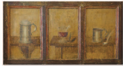
Original painted panels Panellled Room

So many surprises await you in the Museum: colourful new displays tell the town's proud 2,000 year story. Bricks to brewing, costume to coopering, gunpowder to a Georgian garden, even a Tudor merchant's chest and a working telephone exchange. Plus a free programme of special monthly exhibitions in the adjoining Gallery.