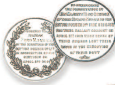
TNT explosion medal, 1916 Gunpowder Experience