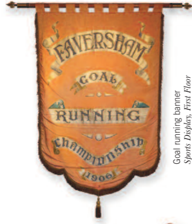
Goal running banner Sports Display, First Floor