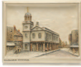
Osborne 'Ivorex' plaque Panellled Room & Gallery