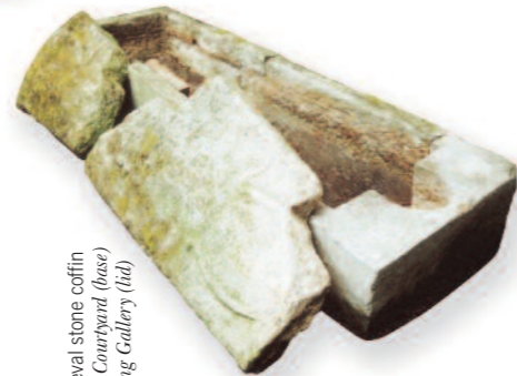
Medieval stone coffin Inner Courtyard (base) & Long Gallery (lid)