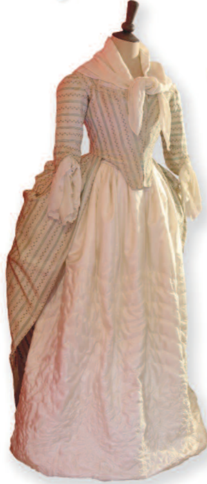
18th-century polonaise dress First Floor, Stairway

Long Gallery • Elizabethan Room • Panellled Room • Fleur de Lis Gallery • Gunpowder Experience • Shops from the Past • Everyday Life in Victorian Faversham • Civic Pride • War Zone • Sports & Entertainment