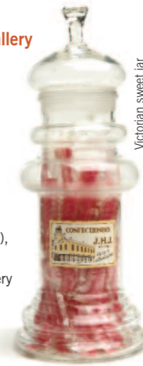
Victorian sweet jar First Floor Shops

FLEUR DE LIS HERITAGE CENTRE takes its name from the inn which for centuries until 1970 occupied the 15th-century building which houses the Museum's core displays. In turn it took its name from the emblem of the monarchs of France. Until 1760 the monarchs of England claimed also to be monarchs of France and incorporated three fleurs-de-lis in their arms.