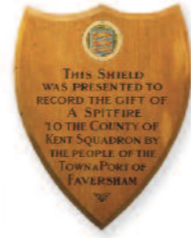
Faversham's Spitfire War Zone