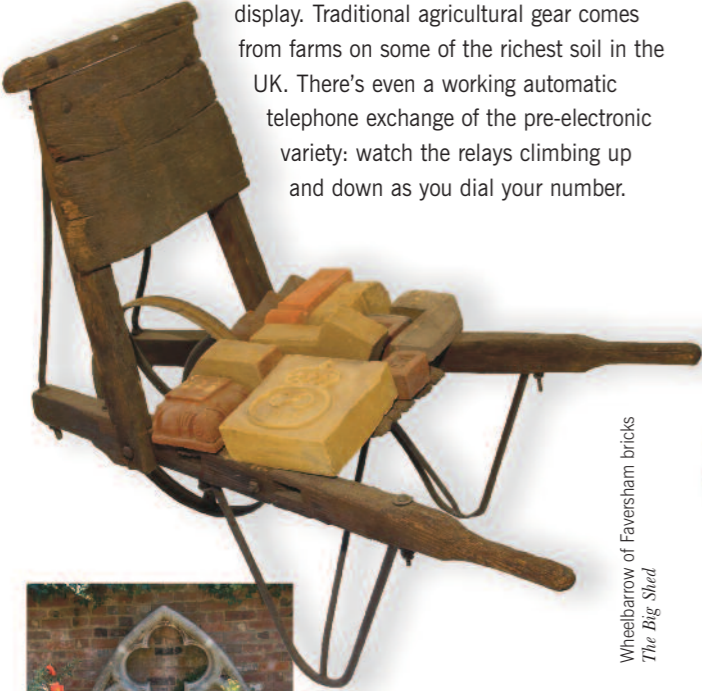
Wheelbarrow of Faversham bricks The Big Shed