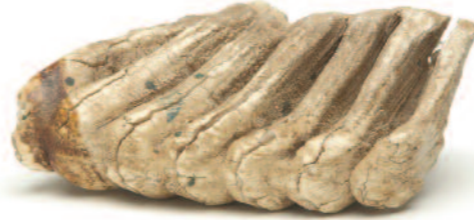
Mammoth tooth Long Gallery