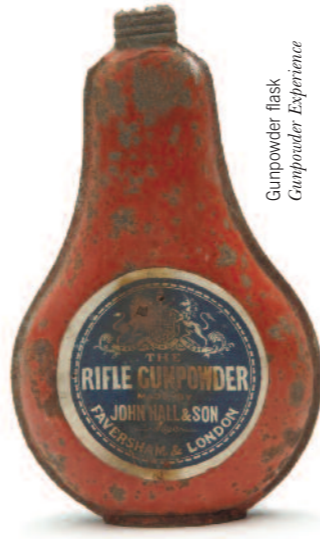
Gunpowder flask Gunpowder Experience